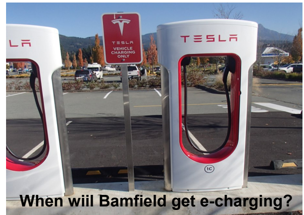
When will Bamfield get e-charging?

where loiters and reading and writers' groups could meet. A stage in support local theatrics (we've had Mystery Theater in the past where local hams (not to be confused with Hamlet) played to a boozy crowd and Bamfield once put on a very credible Wizard of Oz . And local and visiting musicians, poets and politicians could strut their stuff, supported by neat stage lighting and sound systems. Volleying sports , including pickle ball, volleyball, ping pong and badminton (tennis could be possible at the marine station's oldest court on the west coast) are within our reach. And of course there are other possibilities. Most of which are outside of the capabilities of Zoom.