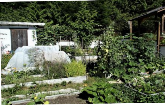
A flourishing community garden. Andre-a's fig tree 4 years away from a Fig Newton, Rae's pet squash, her veggie baby, stolen and the 'wild strawberries running free.