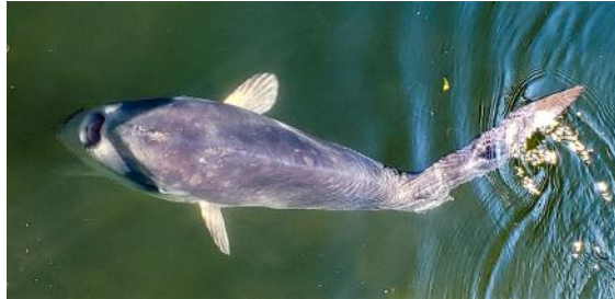
3-foot sun fish stops off at Tishes, "I'm supposed to be in school. But I heard this is where the action is."